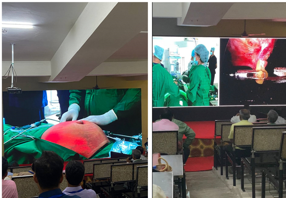
Surgeons at work (part 2)