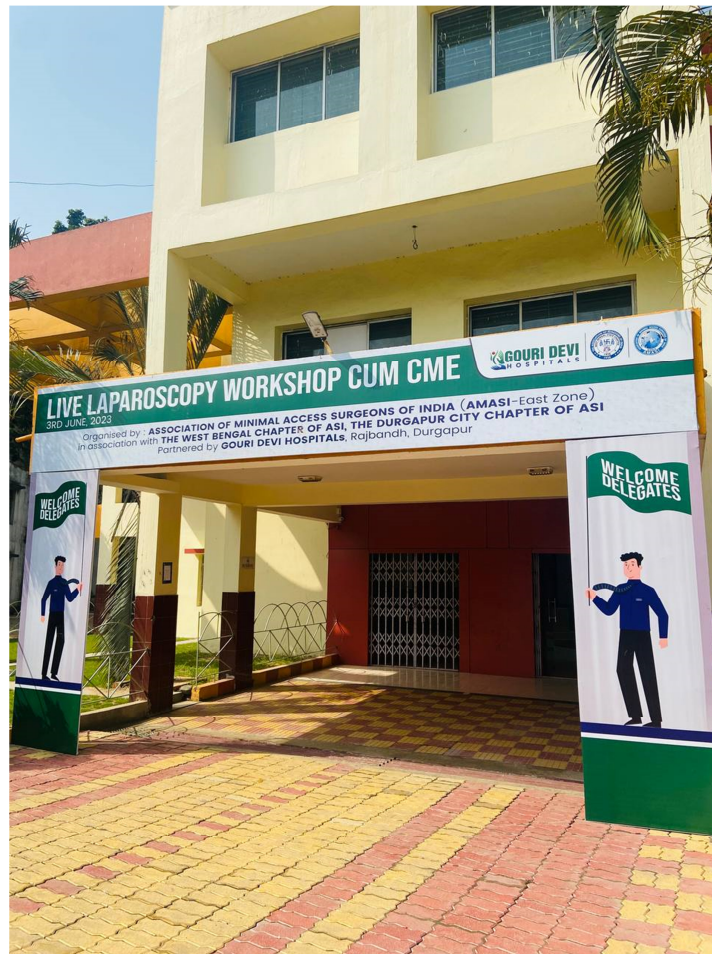
The entrance of the Live Laparoscopic Surgery Workshop cum CME

On the 3rd of June, 2023, an exceptional event, the "Live Laparoscopy Workshop cum CME," was meticulously organized by the Association of Minimal Access Surgeons of India (AMASI - East Zone) . The event was held in Gouri Devi Institute of Medical Sciences and Hospital , in collaboration with The West Bengal Chapter of ASI and The Durgapur City Chapter of ASI .